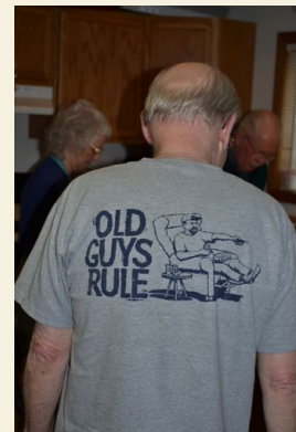
Having fun the Clackamas Cruisers' way!

Invite Your Family and Friends to our Campouts